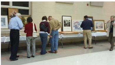
Friends perusing the wonderful collection of art that was available for purchase.

Next year we hope you will come out, bring your friends and neighbors, and support this fundraiser for your church.