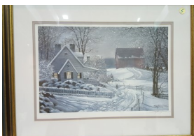
A sample of the art work that was available.